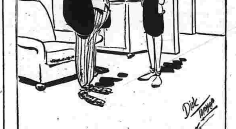
OUT OUR WAY