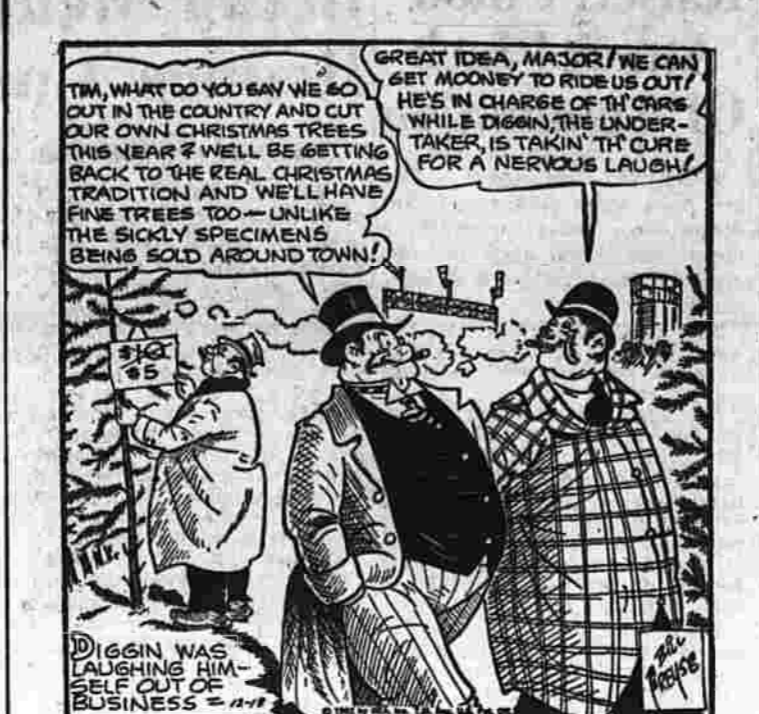
OUR BOARDING HOUSE