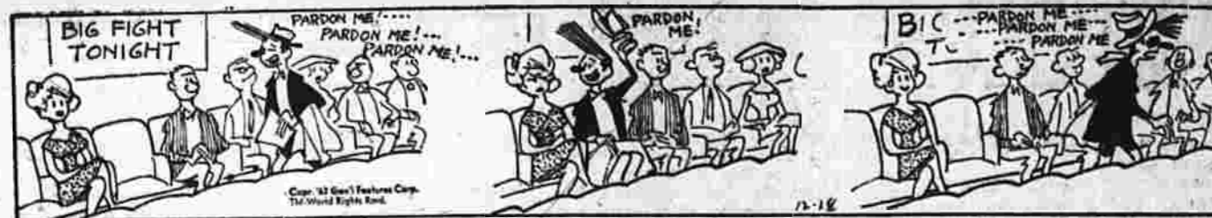
BIG FIGHT TONIGHT